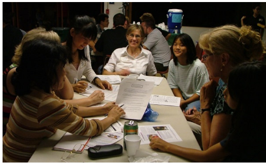
Taking a quiz on vocabulary