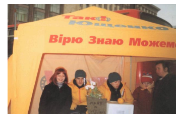
Orange tent filled with students & teachers

The tents self-governing system was amazingly efficient. Teachers were coordinating groups of students. Unarmed guards secured the perimeter; cooks provided the food; unoccupied students slept or cleaned the territory. Thanks to the efforts of medical students, special first-aid tents were set up in the tent city. The typical protest tent on Khreschatyk Street became the main symbol of our revolution, a revolution of smiles and joy, with non-stop concerts, frequent public