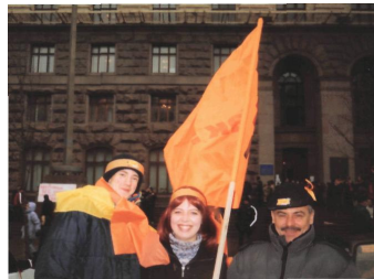
The symbolic orange flag