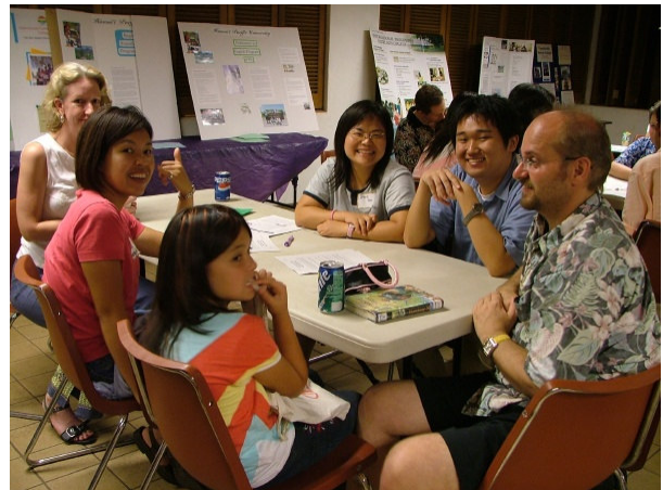
Students and teachers meet for discussion groups