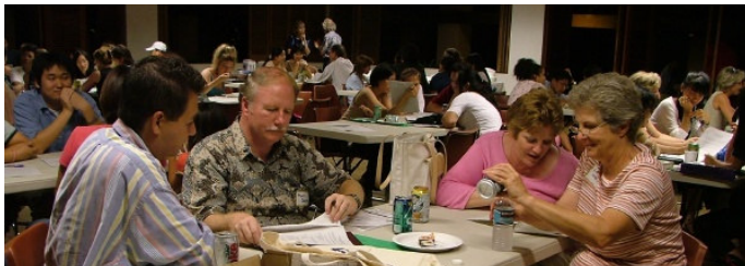
Teachers mingle at dinner