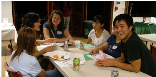
HITESOL student members chat